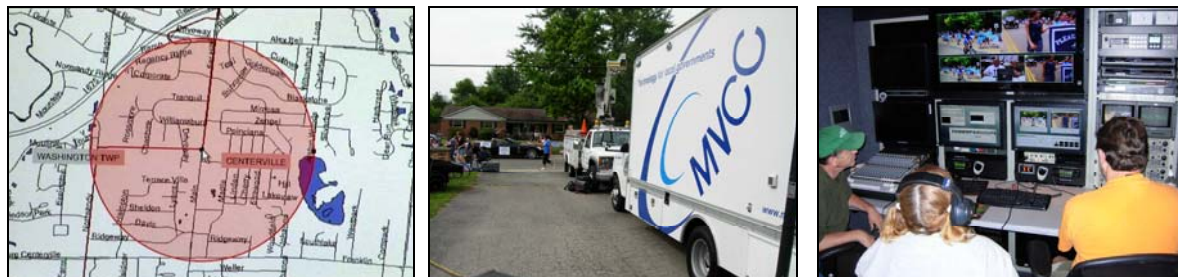
Photos: (left) Hazardous material moving in a targeted area can be tracked, and residents notified. (center, right) MVCC records the Centerville Americana Parade using four cameras and the mobile production studio.

On the morning of July 4, 2009, the MVCC Incident Command Vehicle’s other function – as a mobile television production studio – was utilized to capture the fun and excitement of the Centerville Americana Parade. The mobile production studio is capable of producing a four-camera event on location from any city. The Centerville Americana Parade 2009 can be seen on-demand HERE at the MVCC website www.mvcc.net and on MVCC Channel 5 through Time Warner Cable, Inc.